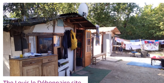
The Louis le Débonnaire site