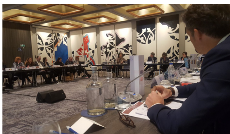
Brussels, 16 March

On 15 and 16 March the national contact points of the European Commission for National Roma Integration Strategies met in Brussels. The first day was dedicated to a discussion about the assessment of the European framework and post-2020 prospects, which was attended by representatives of civil society. The national points of contact met the following day to discuss, in