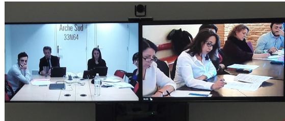
Video conference with Haute-Garonne on 6 April 2018

Since 2013, an annual national appropriations budget has been specifically dedicated to support territorial operations to clear slums and to help support their inhabitants to become integrated. The government has decided to renew this budget of 3 million Euros for the year 2018 to support the implementation of the new instruction of 25 January 2018. A note from DIHAL was sent out at the beginning of March to all of the prefects inviting them to put forward their requests for funding before 13 April. Regarding territories that received funding in 2017, the monitoring of supported actions is carried out in the context of video conference exchanges. Requests for funding will be reviewed from mid-April and the territories will be notified about the funding that they will be granted at the beginning of May.